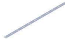
Cable tray W=65/105/205