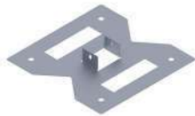
Welded base for support