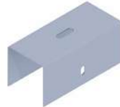
Clamp for welded base