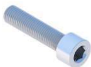
Allen screw M8X100 DIN912 A2 SIM8X100A2