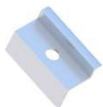
End clamp 35 Nature/Black KLK50/35ALN KLK50/35ALCZ