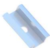
Middle clamp 50 universal Nature/Black KLSR50ALN KLSR50ALCZ